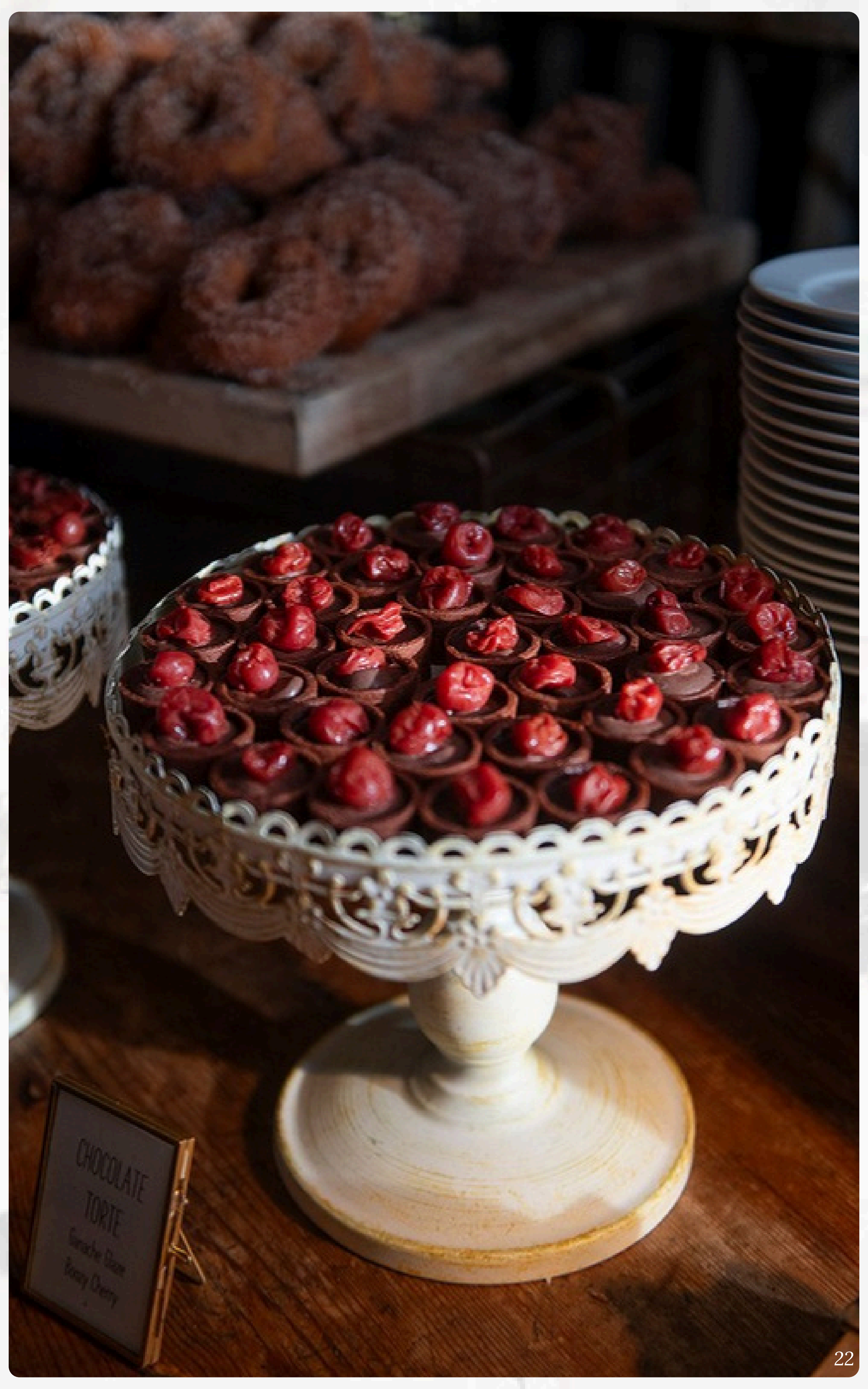
CHOCOLATE TORTE Glace de Cerise